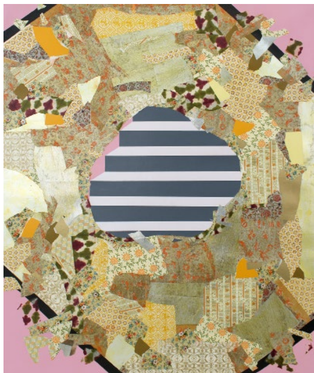
Miriam Schapiro, Flying Carpet, 1972 acrylic and collage on canvas, 60 x 50 inches

In 1970, Schapiro joined the faculty of the newly established California Institute of the Arts and met Judy Chicago, with