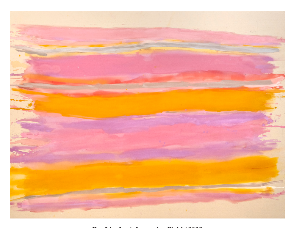
Pat Lipsky | Lavender Field | 2023 acrylic on canvas 56 1/2h x 74 3/4w in

Lipsky's Wave paintings are exuberant, vivid, and fresh. They are, by necessity, painted in one shot: acrylic on unprimed canvas, with color bands in loose wave