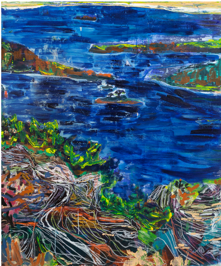
Allison Gildersleeve | Tangle | 2024 oil on canvas 50h x 42w in

or trying something new with every painting. She creates paintings with a physical presence, often using thick layers of paint to create textured surfaces or iridescent medium so that her works create optical effects as the viewer moves in space.