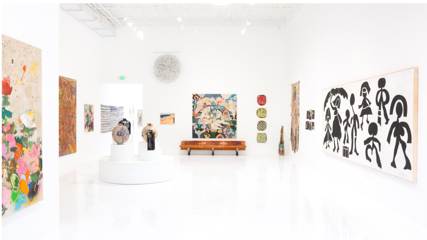
Installation view of Cross Generational , Eric Firestone Gallery, West Palm Beach, January 2026.

Opening Reception: Saturday, January 31, 2026 | 4–7PM