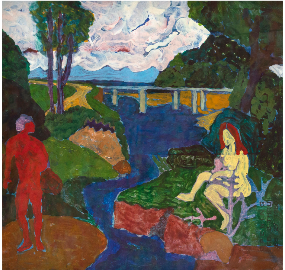
Bob Thompson, Untitled , 1964 oil on paper 10 1/4 x 10 3/4 in.

The gallery participates in international art fairs including Art Basel Miami Beach, Frieze Masters London, and others annually, where booths have recently been highlighted as critic's choices in publications such as the New York Times , Artsy and Artnet . Its New York City shows are frequently highlighted as 'what to see' in these publications as well as The New Yorker , Artforum , and other outlets.