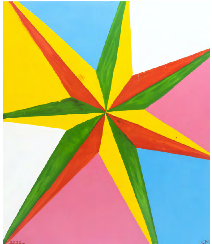
Chris Martin | Seven Pointed Star for LA | 2020 acrylic on canvas 75h x 64w in.

Other work in the exhibition employs a softening and loosening of the grid and compositional structures that defined (and limited) modernist painting. This is visible in